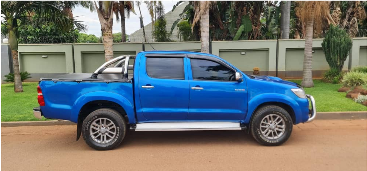
An example of a used truck of the type that would help Short.

A used truck of the type pictured below would meet Short's needs and stand up to these roads.