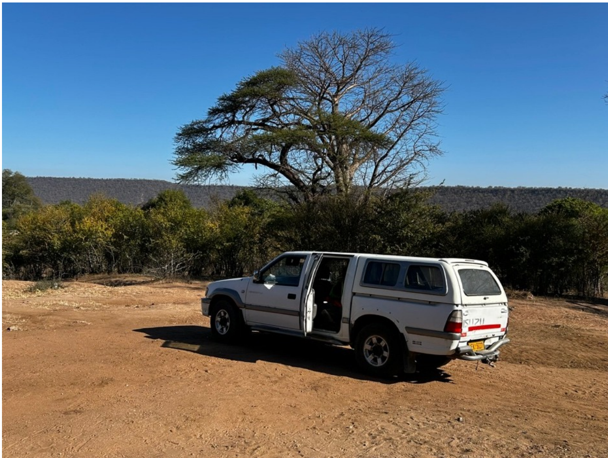
Short's current truck — donated by an Alabama church about ten years ago, well used even then.

Helping a faithful evangelist keep reaching the rural villages of Zimbabwe