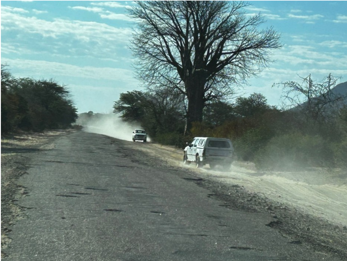
Off the tar and onto the dust — often the smoother of the two.

Sometimes it is better to leave the tar and take to the dust road, which is sometimes marginally smoother. The picture below is again Short's truck.